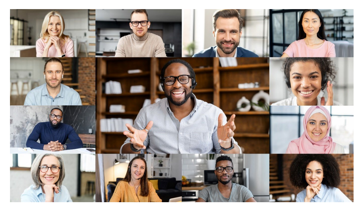
We asked Conference attendees "Do you think the information presented at the Conference will influence the way you interact with autistic people?"

"Yes absolutely. The resources and language shared will positively influence my interactions"